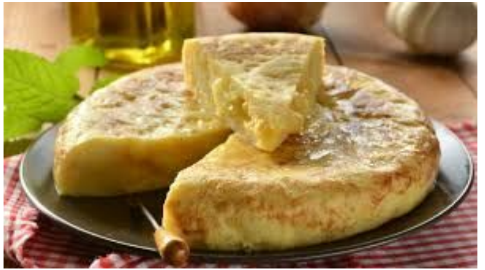
TORTILLA DE PATATAS